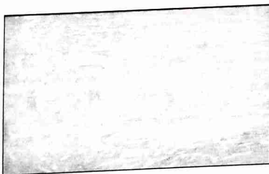
Fig 1: TS. of Normal Intestine of Channa gachua

In the present study on closer observation it was found that the metacercariae of trematode Azygia angusticauda (Stafford, 1904) Bhalerao, 1942 adhere to the intestine of host fishes. These metacercariae were found attached in cluster to intestine as a white spongy ball in Channa gachua (HAMILTON, 1822). The pathological changes were noted in the infected intestine when compared to the uninfected one (Fig.1, 2).